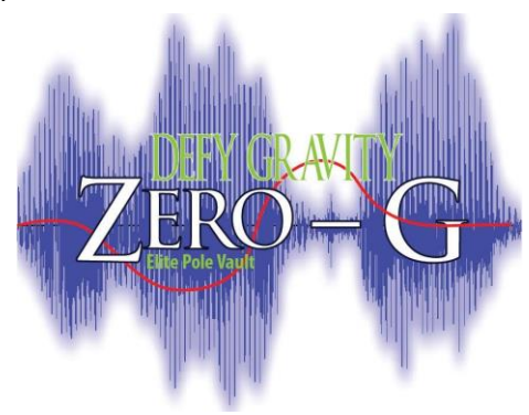
5500 Bogey Lane

Travel South on Steinbeck Bend. Turn right on Bogey Lane. (Before Lakeshore Funeral Home) First left, Gated Entrance.